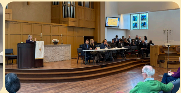
Senior City staff brought their expertise to each of my four Ward 15 Town Halls.

Stay tuned for my next event, including my summer movie night, at RachelChernosLin.ca/events