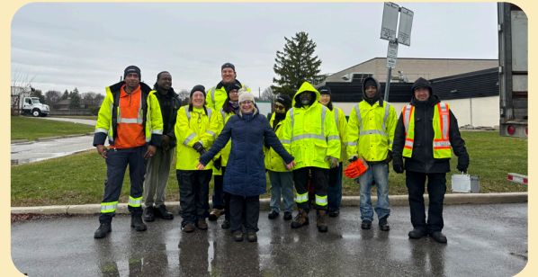
We diverted tons of waste from landfill at my Community Environment Days.