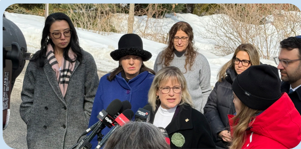
Standing with the Jewish community, both in Ward 15 and across Toronto, at synagogues that were repeatedly targeted.