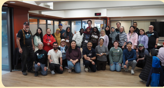
This year, I held my first ever Repair Café in Thorncliffe Park with volunteers from the DVW4EA group!

One of the many joys of my role is connecting with residents at events across Don Valley West. I'd like to thank everyone who participated for your engagement and community spirit!