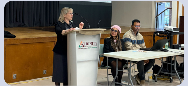
Speaking to members of the York Mills Residents Association about responsible city planning, my work at City Hall, and more.