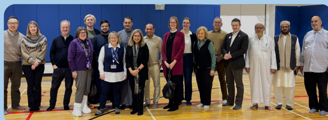
My Interfaith Action group has been volunteering with different congregations in Ward 15 this year.

Developed last fall in response to rising antisemitism, my Ward 15 interfaith group has grown into Interfaith Action, bringing faith leaders and residents of all backgrounds together to build understanding and solidarity. This spring, it was heartening to see neighbours come together at Passover gatherings, Eid celebrations, and community events—demonstrating that protecting one another is a shared responsibility that begins locally, with neighbours standing side by side.