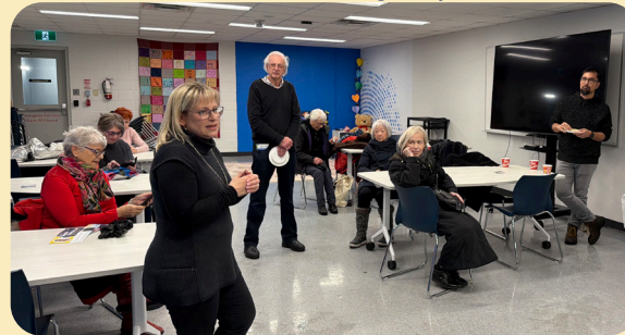
Listening to your feedback and questions at my monthly Coffee Chats.