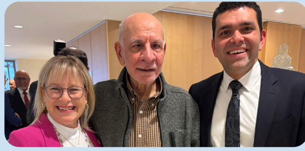
Iftar dinners during Ramadan were so meaningful this year.