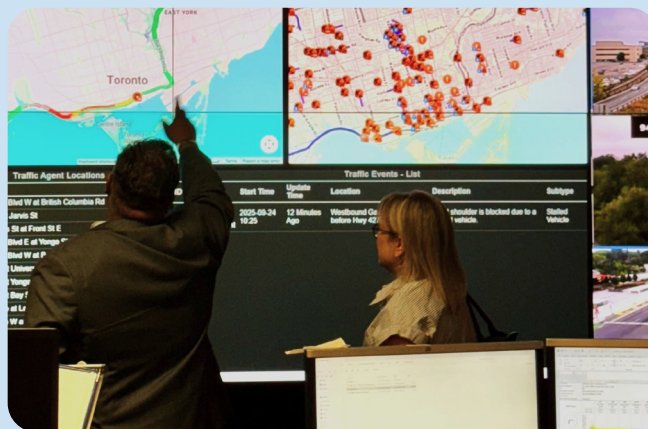
Touring the City's Traffic Operations Centre with Roger Browne, the Director of Congestion and Network Management.

At North York Community Council this spring, I supported measures to make neighbourhood streets safer by lowering speed limits on local roads and lanes to 30 km/h. The changes align with Toronto's Vision Zero Road Safety Plan, which recognizes that lower speeds reduce the risk of serious injury and saves lives. This report includes area-based speed reductions across Ward 15, along with targeted changes on Sandfield Road and Broadway Avenue to improve consistency and safety. This work helps create calmer, safer streets for all road users.