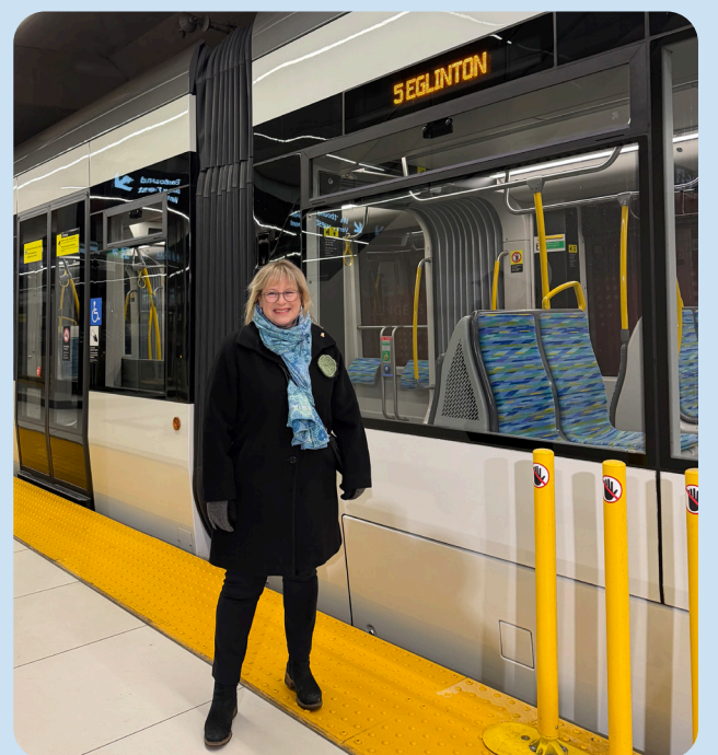
I was delighted to join our provincial leaders at the official opening of the long-overdue (but eagerly awaited!) Line 5.

As Line 5 Eglinton settles into regular operation, expanded service hours are improving daily travel across our community. Since April 5, the line has been running longer hours, strengthening connections between Ward 15 and the rest of the city. Line 5 now operates from 5:30 a.m. to 1:20 a.m. Monday through Saturday and from 7:30 a.m. to 1:20 a.m. on Sundays, with overnight shuttle buses continuing nightly. These improvements increase flexibility for riders, ease bus congestion, support local businesses, and help ensure Line 5 delivers long-term benefits for our neighbourhoods. For schedules and notices visit ttc.ca/line5 .