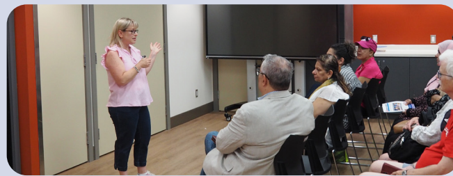
Welcoming residents to my Coffee Chat in Thorncliffe Park.

That is why I brought forward a motion at City Council calling for greater transparency around how the City evaluates AI data centres. As these facilities continue to expand, Toronto must ensure the review process is clear, accountable, and aligned with the city's environment, infrastructure, and community priorities.